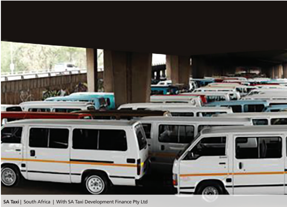
SA Taxi | South Africa | With SA Taxi Development Finance Pty Ltd